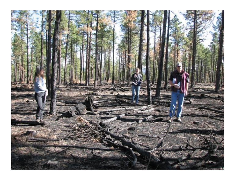
Thinned ponderosa pine after a prescribed burn. The original stand was an even-aged stand without much vertical structure. Pritzlaff Ranch, San Miguel County.

A goal of this work is to develop a web-based library of case studies of treatments applied to forests across the state. Although this is a work in progress, the case studies will be accessible on the NMFWRI web site, and the intent is to give forest managers a place to go when they would like to obtain information regarding prescriptions used in similar vegetation types across the state. An example of the format for these case studies can be accessed via the <u>prescriptions</u> link on the NMFWRI site.