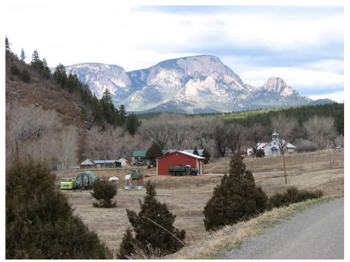
The upper reaches of the Gallinas Watershed, near Hermit's Peak.

Using state funds, the NMFWRI will continue to develop an online directory for forest products companies and thinning contractors, as well as seek ways to develop new educational initiatives in the Las Vegas area and beyond. We are also interested in finding an individual who can assist us in developing an oral history of fire, grazing, and forest management in the forested areas of the state. Finally, we will continue to work on marking and thinning a private forestry demonstration area in collaboration with the Pritzlaff Ranch and the Biophilia Foundation.