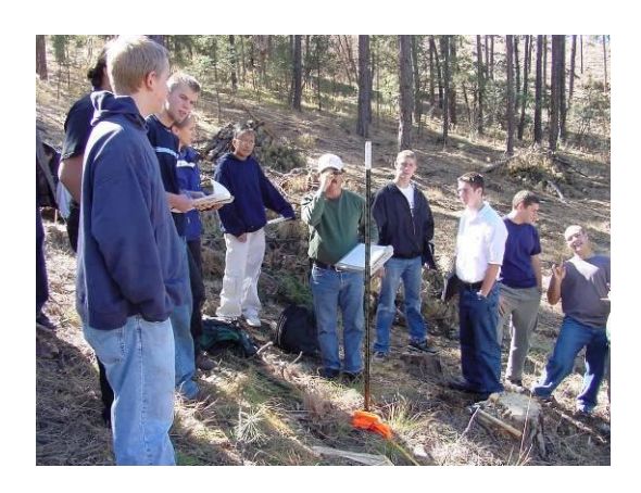
Students from Ruidoso High School learn about field data collection and monitoring for a CFRP project in the Lincoln National Forest.