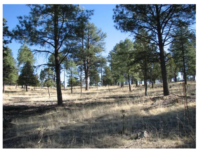
Thinned stand on a residential property near Ruidoso. Note the separated tree crowns and the healthy grass cover. The original stand was dense piñon and alligator juniper beneath an open overstory of young ponderosa pine. Treatment removed two-thirds of the stems in the stand, but less that half of the biomass.

One of the initial efforts of the NMFWRI was to collect information on fuels treatments in southwestern, and especially New Mexican, ponderosa pine and lower mixed conifer forests, and piñon-juniper (PJ) woodlands. One idea that is stressed in the scientific literature is that fuels treatment, while beneficial to human communities and helpful in maintaining forest health, is not necessarily restoration. Thinning for fuel treatment may not preserve historic structure, and in the short term, may increase fine fuels. In contrast, ecological restoration refers to the process of assisting the recovery of a degraded ecosystem, moving it from where it is, onto a trajectory that is closer to the historical range of variability. Historically, fire was an important natural element in southwest forests, burning excess production and maintaining structure in the stand, without burning up watersheds.