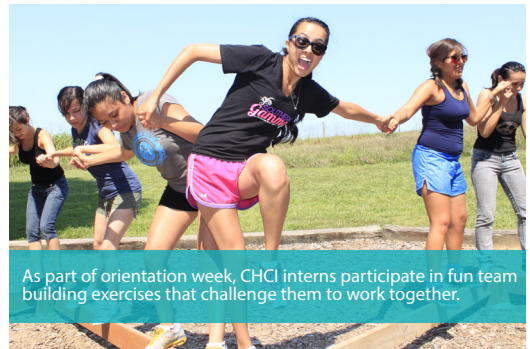
As part of orientation week, CHCI interns participate in fun team building exercises that challenge them to work together.

Interns will also be required to engage in a CHCI community service project. This component of the curriculum broadens students' personal experience with civic engagement and allows interns to give back to the community.