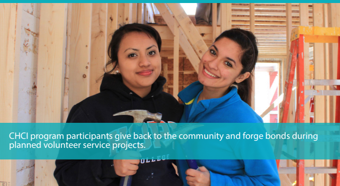
CHCI program participants give back to the community and forge bonds during planned volunteer service projects.