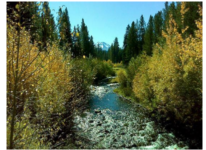
Hat Creek District