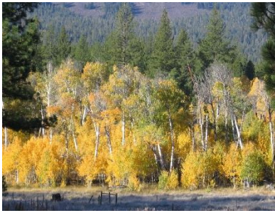
Eagle Lake District