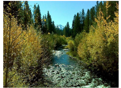
Hat Creek District