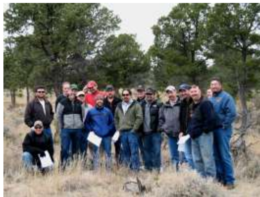
Federal firefighters that attended the second 401 series short course, Natural Resource Ecology, at Highlands University.

From October 2007 to February 2008, the NMFWRI worked with Highlands' faculty and staff and the Region 3 supervisor's office to deliver four courses for the federal 401 series fire fighting personnel. Approximately 16 firefighters from four states attended the courses, and Highlands is preparing to offer an additional three courses in the upcoming fall and winter.